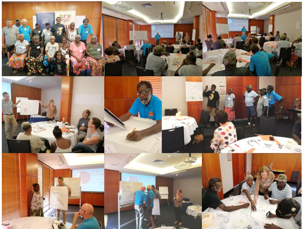
Glimpses of Governance Training