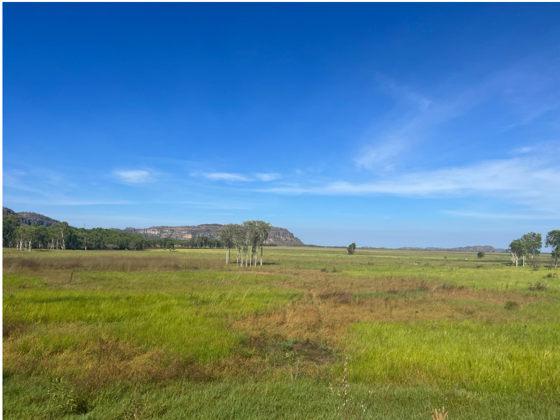
Gunbalanya scenery views

Red Lily acknowledges the traditional owners and custodians across the lands on which we live, work and we pay our respect to elders both past, present and emerging.