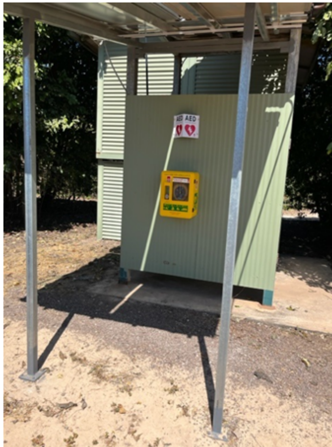
AED installed at Coburg

This completes the project for Red Lily, each community now has access to an AED.